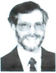
Scott Thomasson Mayor