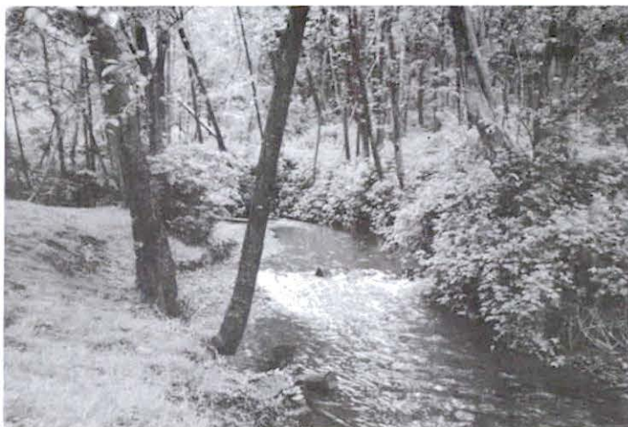
Des Moines Creek empties into Puget Sound at Des Moines Creek Park.

Des Moines Creek currently provides a limited amount of fish and wildlife habitat from Marine View Drive to South 200th Street. However, the Beach Park currently provides the most heavily utilized fish habitat in the stream system. Significant numbers of coho and chum salmon, steelhead, and cutthroat trout have been observed recently in the